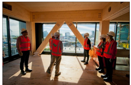
Lendlease's 25 King Street is built from timber.

In Brisbane, Lendlease has nearly completed a nine-storey commercial building from timber which will make it the largest building of the material built in Australia. Lendlease are pressing on with advancing the technology in its projects, preferring the material due to its lower cost and ease in assembly, saving time in the construction process. It can be as fire safe as concrete, as this particular building is.