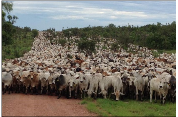
Consolidated Pastoral Company is for sale

Rural valuations have been rising in the northern states as productivity boosts on the back of land improvements. Consolidated Pastoral Company has seen a boost in asset values of 5% in the last 12 months. Earnings, however, are down for cattle producers as prices for beef increase and sales volumes decrease from last year. The company, which has 16 cattle stations spanning 5.5 million hectares of land and accommodates approximately 400,000 cattle, is for sale, with expectation of just below $1bn.