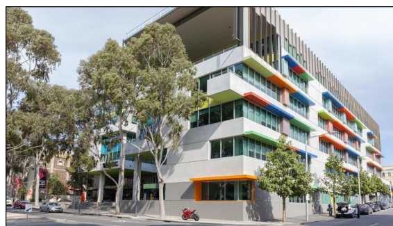
TAC Headquarters Geelong: Sold $115.25m, 7% yield

Australia's level of household debt coupled with falling property prices poses the biggest risk to the Australian economy, says a report from the Organisation for Economic Co-operation and Development. It says the risk of rising global interest rates is increasing off the back of a debt-fuelled fiscal stimulus package into an already-firing US economy, potentially spawning greater inflation.