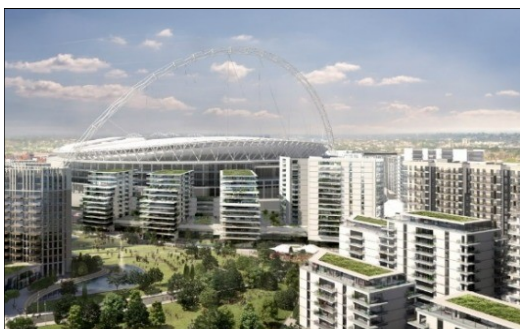
Build-to-rent development in Wembley Park, London

It is argued that a land tax system overhaul is needed to make build-to-rent systematically viable. The current system charges property owners of larger parcels of land in much higher annual land tax brackets, reducing long-term viability. If build-to-rent is accepted by government in Australia, industry says land tax reductions would be required. This is reportedly accepted by housing affordability bodies as they say it promotes more affordable, professionally managed housing as opposed to mum-and-dad landlords.